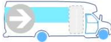
Small Banner – Curb

Space Approx. 13.5 ft. wide X 5 ft. tall